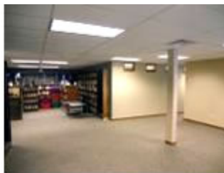
Phase 1 open space