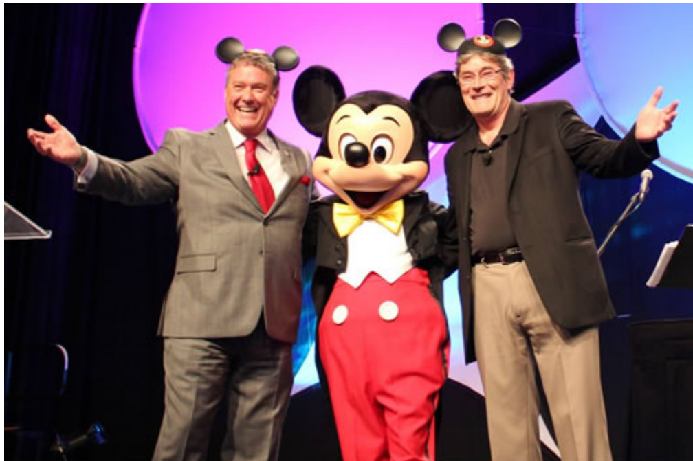
Not every president and spiritual leader look this good in Mickey Mouse ears!

Save the Date! We are planning another amazing program for you in Las Vegas, Nev., from Feb. 16 - 19, 2015. We will have flexible room rates starting at just $65 per night at the The Quad, Flamingo, Planet Hollywood and Caesar's Palace.